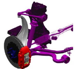
SPORTS DYNAMICS VANQUISH